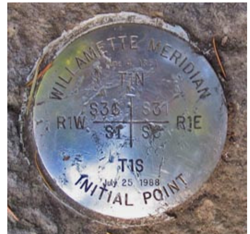
Photo: Willamette Meridian Marker initial point, Willamette Stone State Heritage Site, Portland.

This monthly program is sponsored by the Tualatin Historical Society.