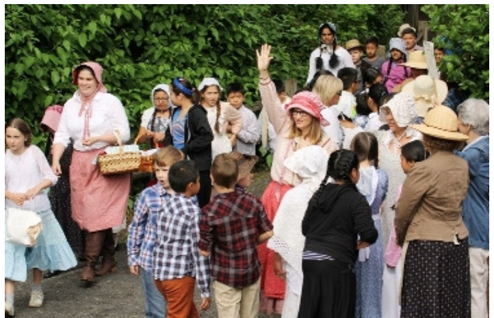
Photo above: Bridgeport Elementary 4th graders, teachers and parents arrive on the Sweek Pond trail. ~ Photo courtesy of Dana Entler.