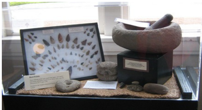
Photo above: One of our popular displays is a collection of found objects such as arrowheads, grinding bowl & pestle, stone maul and grooved cobble fish net sinker.

So we need to get serious again about planning and financing additional space for material objects like old Tualatin fire department artifacts, three historic wagons and Ice Age evidence which continues to be found and offered to us.